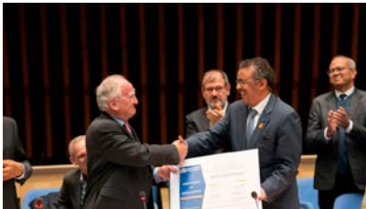
@WHO | World Health organization | 26.08.2020

#AfricaKicksOutWildPolio In 2019, wild poliovirus type 3 is certified to have been eradicated globally.