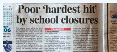
@MichaelMarmot | Sir Michael Marmot | 9.08.2020

Opening schools safely is key to reducing inequalities in education and beyond.