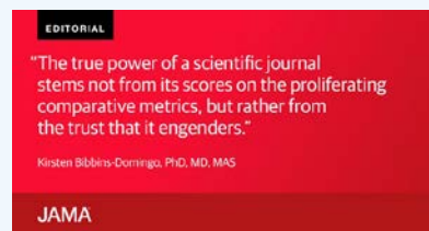
@JAMA_Current | JAMA | 5.07.2022