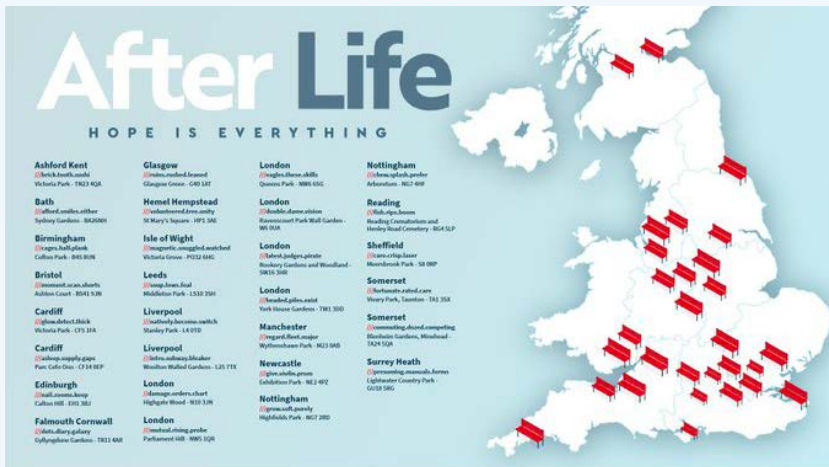
@RickyGervais | Ricky Gervais | 15.07.2022

If you get a chance this summer, try to find one of the 30 #AfterLife benches we've stuck around the country to encourage people to talk. #HopelsEverything