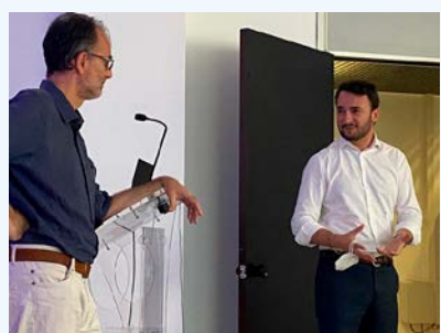
@ForwardRPM | Progetto Forward | 7.07.2022