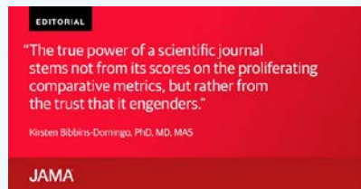
@JAMA_Current | JAMA | 5.07.2022