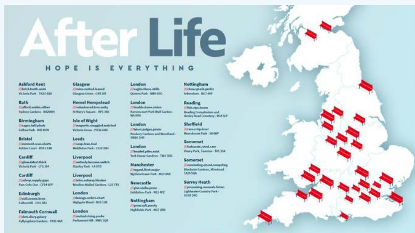
@RickyGervais | Ricky Gervais | 15.07.2022

If you get a chance this summer, try to find one of the 30 #AfterLife benches we've stuck around the country to encourage people to talk. #HopelsEverything