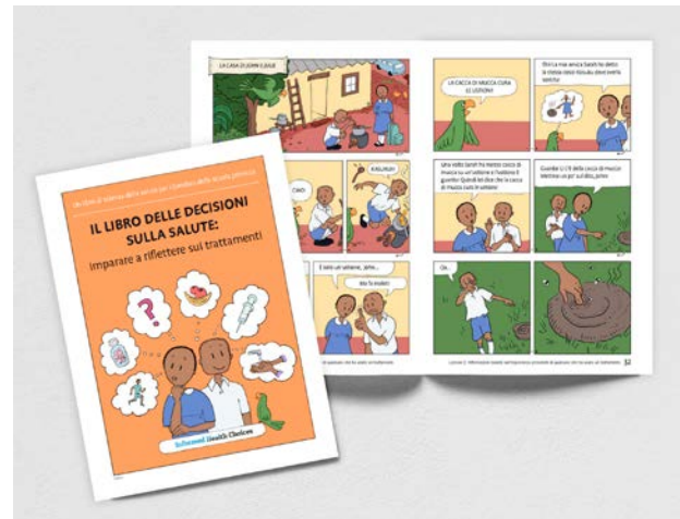
Figure 1. Cover of the Italian version of "The Health Choices Book" (2019).

In the 2019-2020 schoolyear we carried out a first pilot study through nine one-hour lessons in two fifth grade classes (46 students) of a public primary school